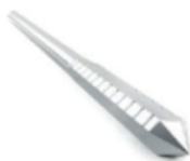
Calcaneal Slide: Shannon Larga Ø 3 Lg 20 mm (7cm) Shannon X-Larga Ø 3 Lg 30 mm (10cm)