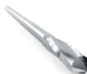
Cheilectomy, Osteophytes: Wedge Ø 3.1 Lg 13 mm