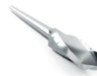
Cheilectomy, Osteophytes: Wedge Ø 4.1 Lg 13 mm