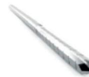
Bunion, Joint prep: Shannon Longa Ø 2.2 Lg 22 mm