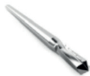
Hammertoe, Akinette: Shannon Corta Ø 2 Lg 8 mm

The Novastep Percutaneous Burrs are designed specifically for Mini Invasive Surgery needs. Cylindrical and conical burrs are made of hardened surgical grade stainless steel, highly resistant to wear, providing an optimal cutting quality.