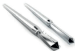
Akin, DMMO: Shannon Recta Ø 2 Lg 12 mm Shannon Helical Ø 2 Lg 12 mm